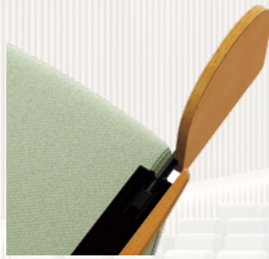
18mm thickness for stable note-taking