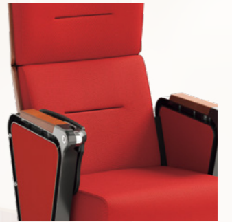
Side-fold design for convenient storage