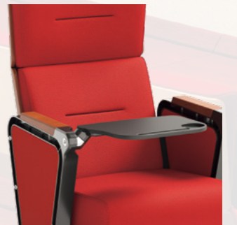
Equipped with a cup holder and pen slot