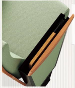
Space-saving design, easy to fold into the armrest