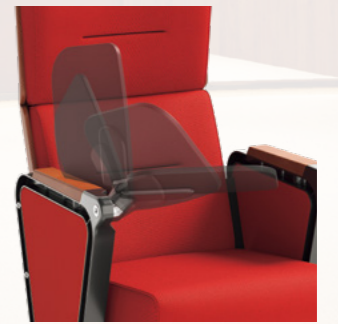
3D rotation within specific track to avoid collisions