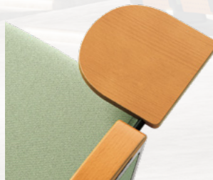
natural wood grain, soft and warm