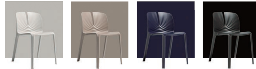
Light grey Pinkish grey (for customization) Ink blue (for customization) Black