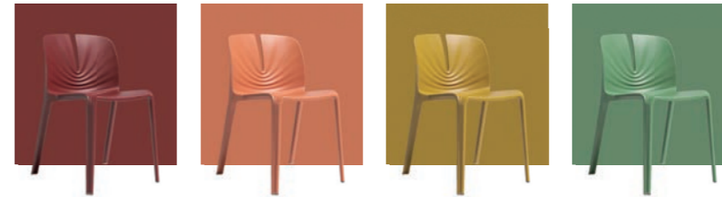
Marsala red Coral red Ginger yellow Morandi green